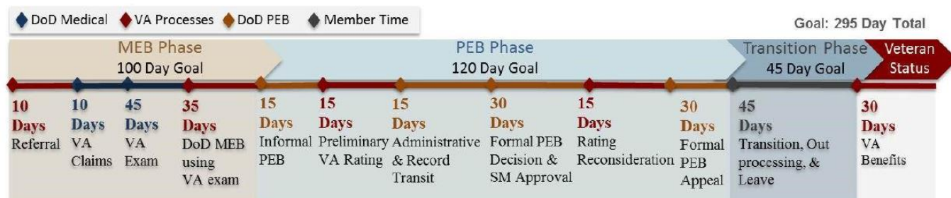
The IDES Timeline follows the four phases: MEB, PEB, Transition, and VA Disability Compensation Benefits Phase.

Marines and families do not have to navigate the IDES alone. The Physical Evaluation Board Liaison Officer (PEBLO) and the VA Military Service Coordinator (MSC) are non-medical case management specialists in place to provide assistance and information to the Marine and his/her family. Additionally, both specialists know the unique issues surrounding each case and will coordinate medical appointments and liaison with all government agencies (DoD, VA, and Social Security Administration) in order to ensure the Marine and his or her family are aware of all processes and procedures.